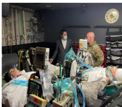
Secretary LaRose tours UC Health's training center for military medics and discusses poll worker recruitment and voter engagement initiatives.

Secretary LaRose fulfilled his legal responsibility to maintain the accuracy of Ohio's voter registration database by removing abandoned registrations. You can check your registration or update your information, visit VoteOhio.gov .